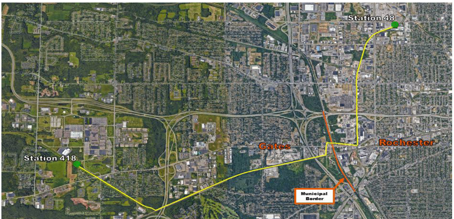
Planned route of new transmission line (L949) between Station 418 in the Town of Gates and Station 48 in the City of Rochester.

To comply with these more stringent reliability standards issued at the federal level, RG&E plans to install a new 115 kilovolt (kV) transmission line (L949) between Station 48, located on Lexington Avenue in the City of Rochester, and Station 418, located in the vicinity of the Rochester Technology Park in the Town of Gates, and to expand and upgrade Stations 48 and 418 to accommodate the proposed new line. This project, known as the Rochester Transmission Project (RTP) Enhancement, will provide an additional source of power to Station 418, reinforce the bulk power supply and ensure reliable service under certain contingency scenarios.